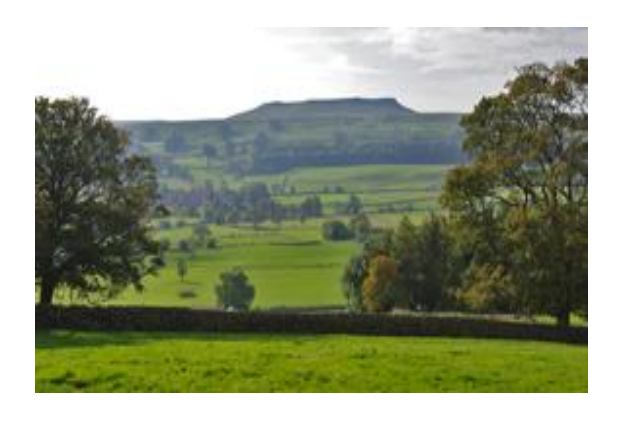
View across Wensleydale towards Addlebrough

ASKRIGG There are shops, tea-rooms, two inns - The Crown and the Kings Head, and a hotel, plus a choice of other B&B accommodation, with more of the same just over a mile away in Bainbridge. The Kings Arms masqueraded as The Drovers Arms in the James Herriot programmes whilst almost opposite, Cringley House provided the exterior scenes of Skeldale House. A market cross stands on the cobbled area in front of the 15th Century church of St. Oswald. To the right of the church, a lane leads to the start of a woodland walk to Mill Gill and Whitfield Gill waterfalls. Time has passed Askrigg by since the Richmond to Lancaster turnpike was superseded by the main road across the valley. The elegant houses on the main street date from prosperous times in the 18th and 19th centuries. There has been a revival of fortunes in recent years with the village's fame in the James Herriot television series.