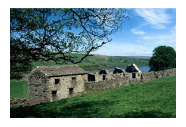
Ruined church at Stalling Busk

HUBBERHOLME, just up the valley, provides further accommodation. Its church is worth a visit for its exquisitely carved woodwork.